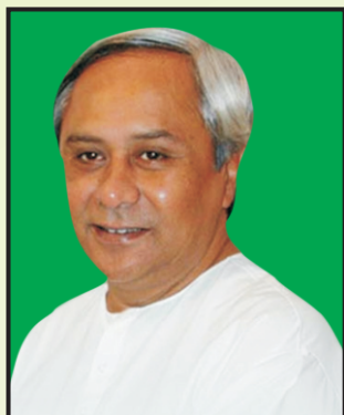
NAVEEN PATNAIK CHIEF MINISTER, ODISHA